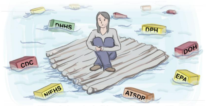
"How do I navigate this sea of acronyms?"

primarily government agencies and public institutions, that may be a source of expertise or may otherwise be involved in responding to communityidentified environmental health concerns (even when not invited...). Individuals, governmental agencies or universities each bring a set of political and logistical issues along with their expertise. Thinking through the repercussions of collaboration is an important step. Toward the end of this