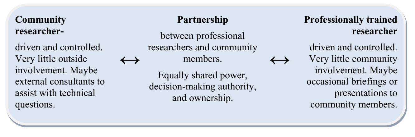
Figure 7.2: Spectrum of community participation in health studies

Academic researchers are more frequently involved in CBPR, often funded by grants from the CDC and NIEHS. However, private foundations, universities, and state/local agencies have also funded some CBPR (Viswanathan, et al., 2004).